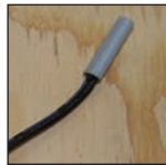
10' (3 m) floor sensor